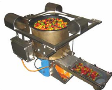
Sticky fruit feeder with hopper insert feeding jujubes.