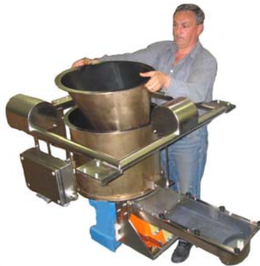
By simply adding the hopper insert, the sticky fruit feeder can then be used with free-flowing products. For increased hopper capacity a 4.5 cuft hopper addition can be installed