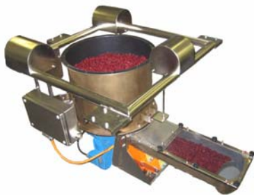
Sticky fruit feeder feeding dried cranberries

One feeder - two very different materials!